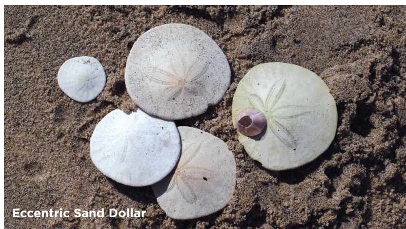
Eccentric Sand Dollar