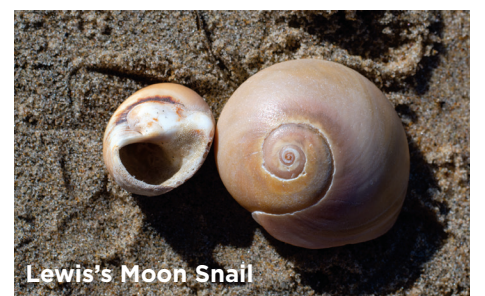
Lewis's Moon Snail