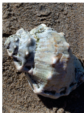
California Frog Shell