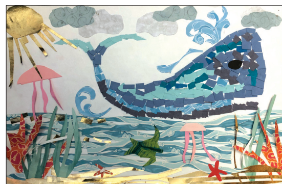
CALEB MAZZARELLA, Grade 10, Grades 9-12