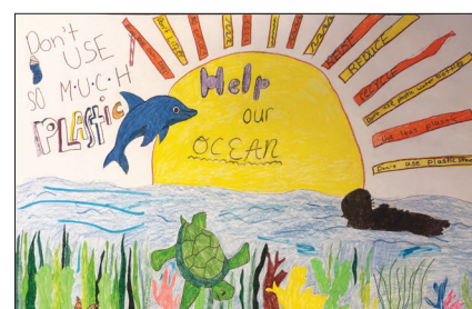
EMMA LUND Grade 5, Grades 3-5