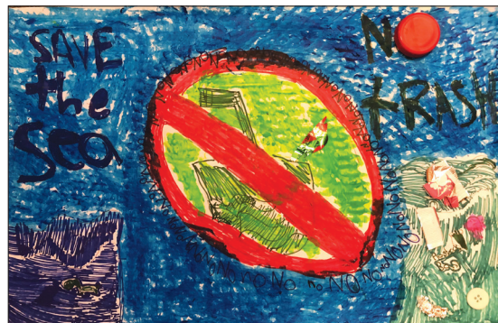
LIZZY JOUBRAN Grade 2, Grades K-2