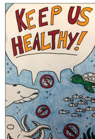
CAROLINE COLE Grade 8 Grades 6-8