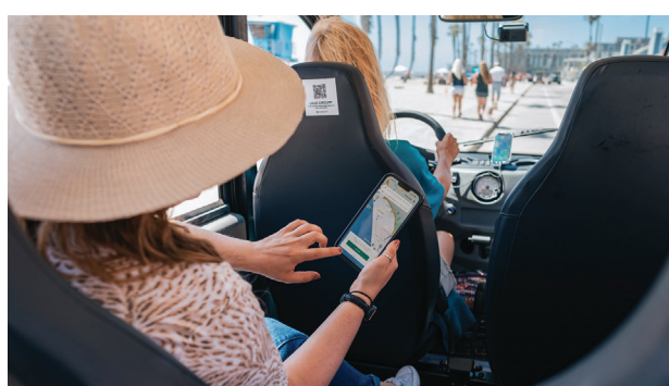
Passenger using the app