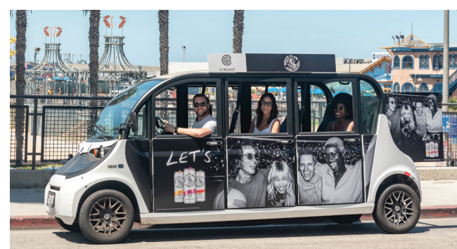
Santa Monica Circuit

For more information visit EMERALDKEEPERS.ORG