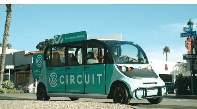
FRED in San Diego