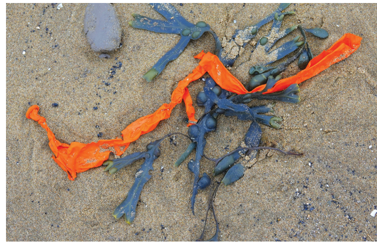
Balloon pieces regularly wash up on beaches.

Balloons that float into the sky eventually fall to earth as hazardous litter. Deflated or burst balloons that land in waterways pollute. Wildlife can mistake colorful balloons as food and ingest the dangerous particles. Animals can also become entangled in balloon strings damaging their feet, hands, or wings. Coronado